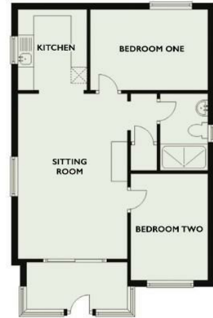
Garden Log Cabin